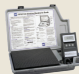
PROGRAMMABLE REFRIGERANT CHARGING SCALE