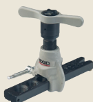
RATCHET FLARING TOOL